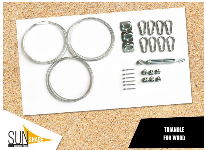
TRIANGLE FOR WOOD