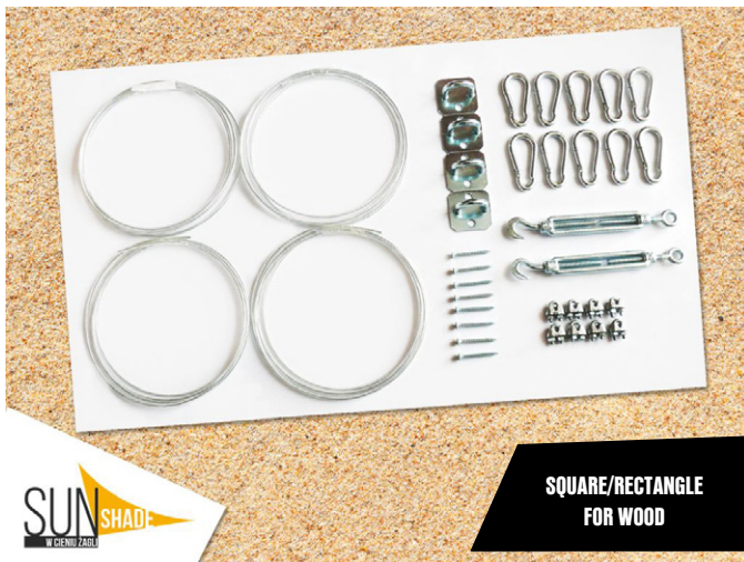
SQUARE/RECTANGLE FOR WOOD