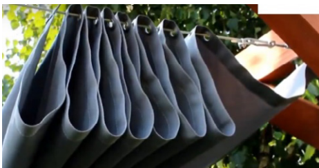
Figure 1a. Retracted sun sail with visible fixing to the structure.