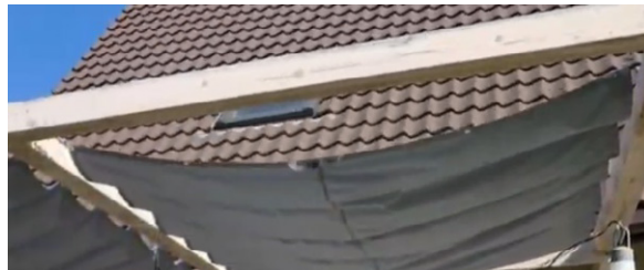
Figure 1b. Retractable sun sail on 2 ropes