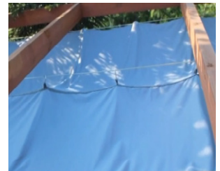
Rysunek 1c. Top of retractable sun sail on 3 ropes