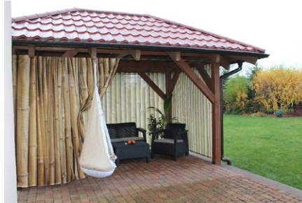
Figure 1. Gazebo curtain