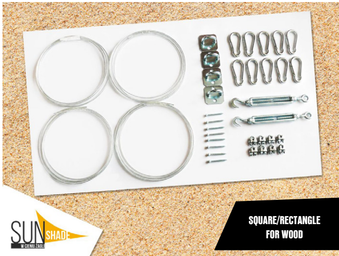
SQUARE/RECTANGLE FOR WOOD